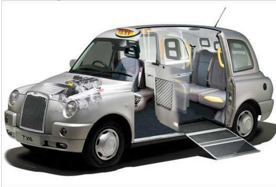
Picture 2 Driver's cab